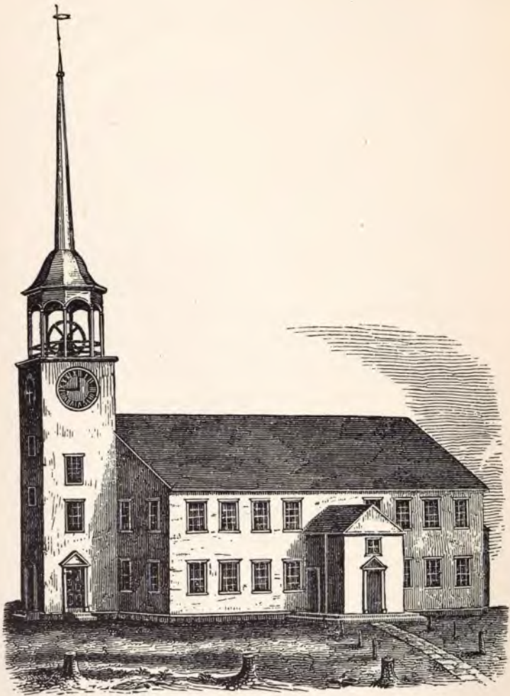
MEETING-HOUSE OF THE FIRST PARISH.--1740-1825.